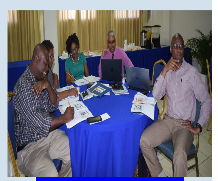
A light moment is enjoyed by some senior managers.