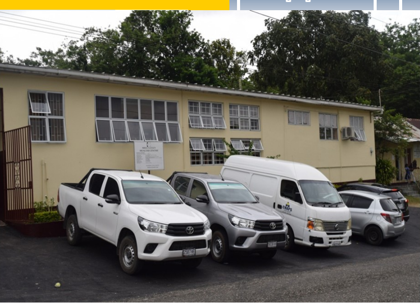
The front view of the Mile Gully Health Centre.

expectancy is significantly higher, is the vigour of our primary health care system as typified by what we are witnessing today" Mr. Chen said.