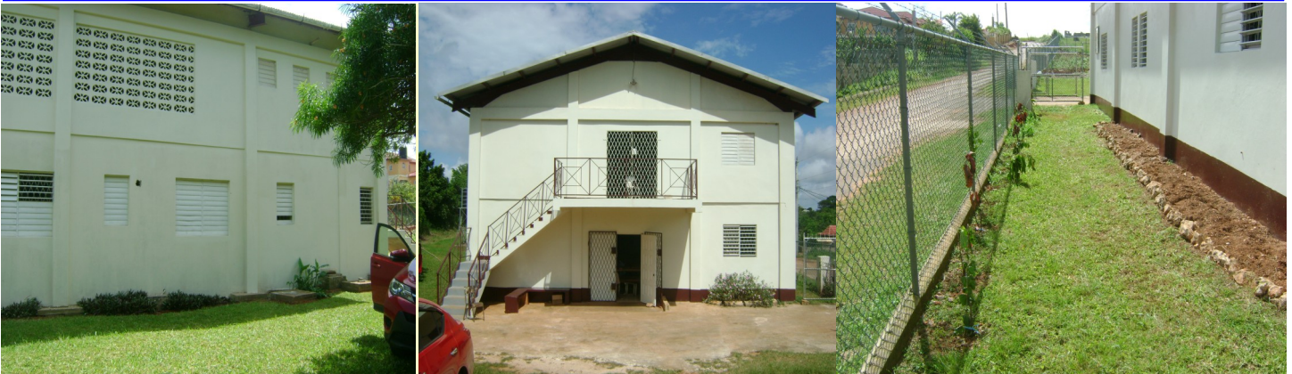
Work carried out at the Lincoln Health Centre.