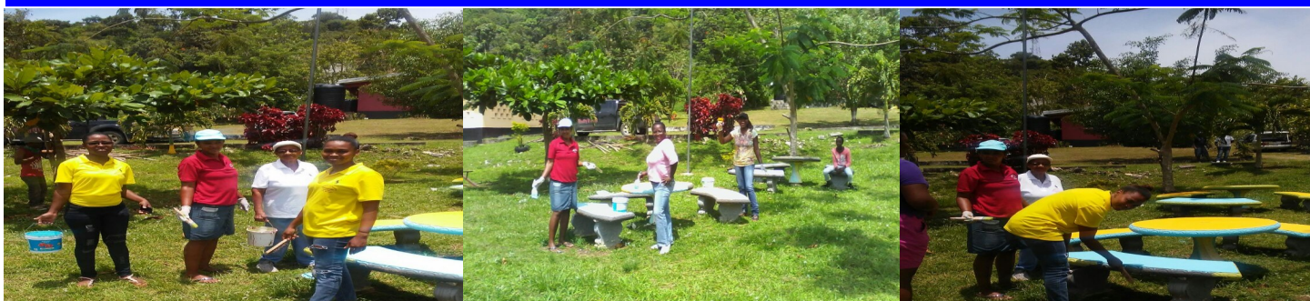
Labour Day at the Springfield Health Centre.