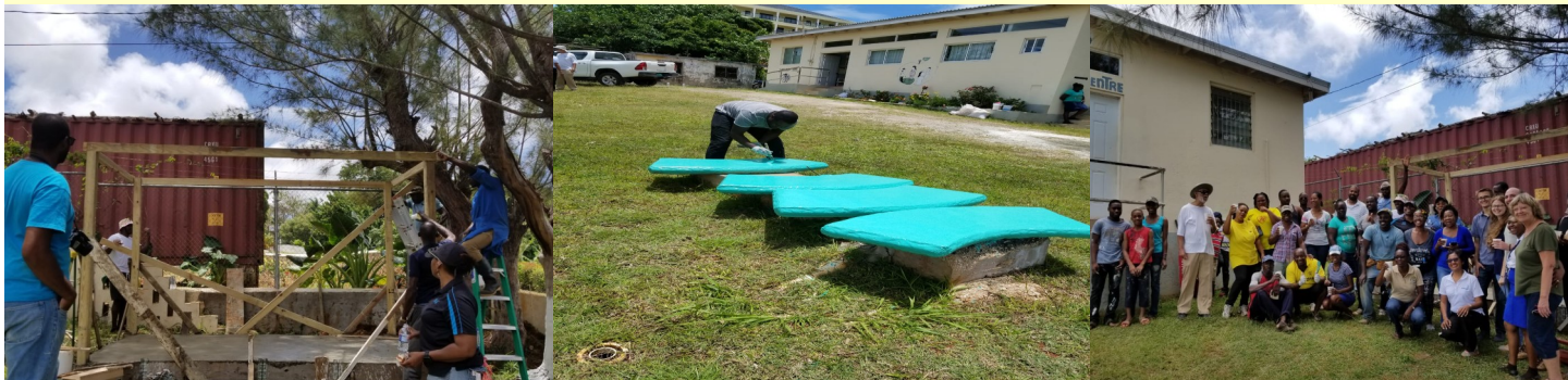
Work being done at the Malvern Health Centre.