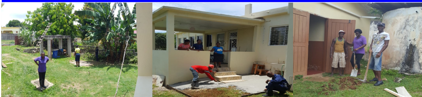
Work being done at the Balaclava and Myersville Health Centres.