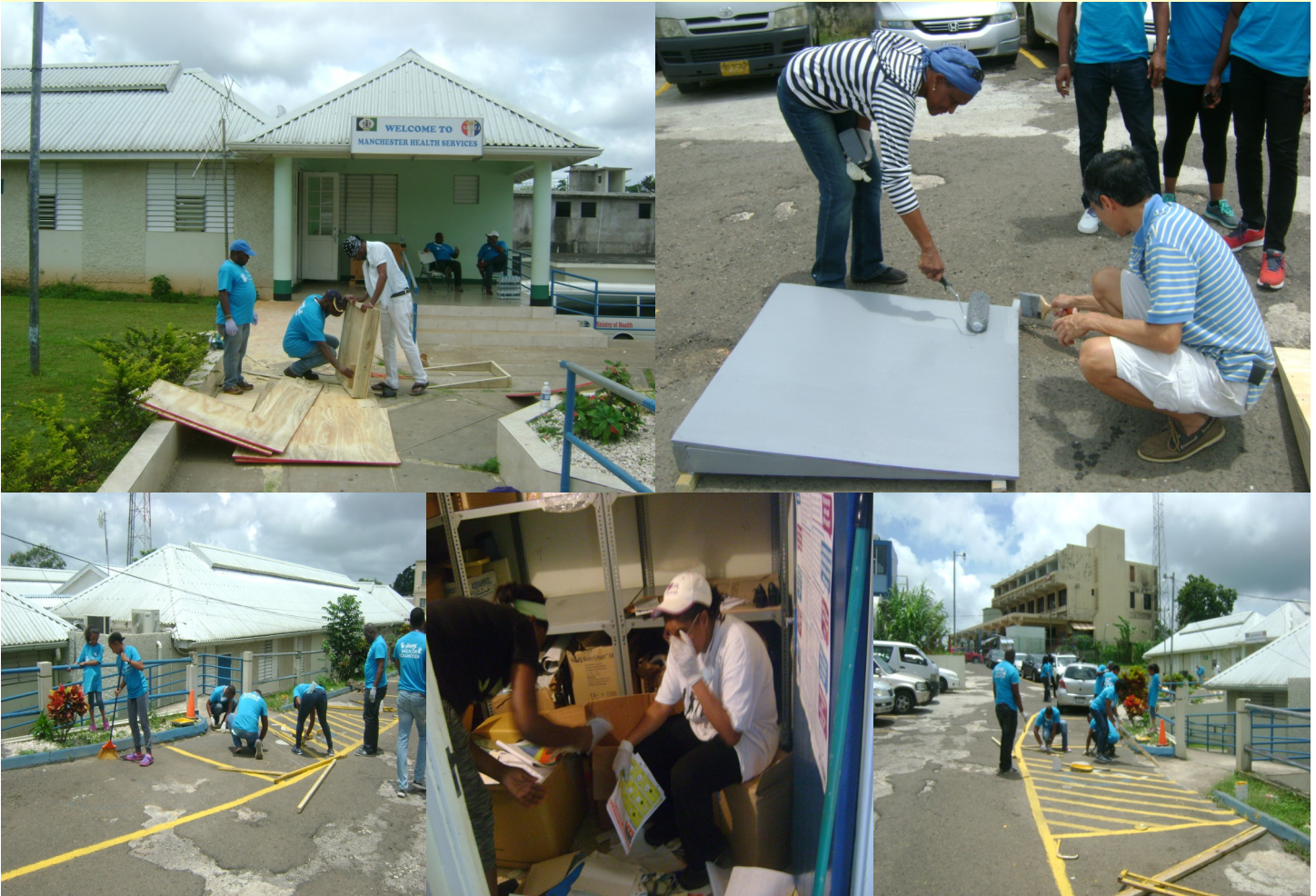
Work being done at the Mandeville Comprehensive Clinic.