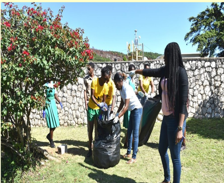
Students and teachers of the Winston Jones High School in Manchester participate in clean-up activities on Friday, January 24.