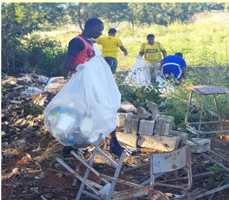
Students from the Black River High School in St. Elizabeth participate in clean-up activities.

Please see below photo highlights from the clean-up activities in St. Elizabeth.