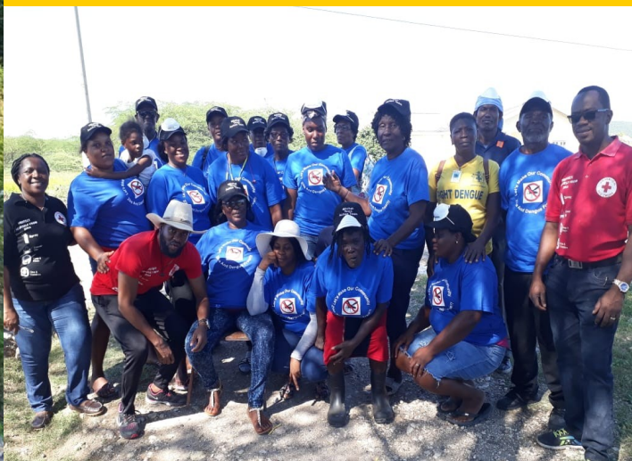
Staff members from the Clarendon Health Services who participated in the clean-up activities.