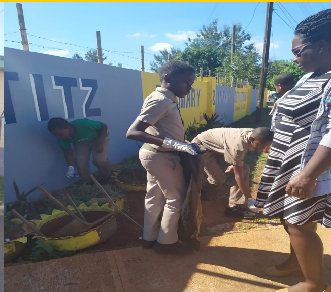
Students and teachers from the Lititz Primary School in St. Elizabeth cleaned their surroundings.