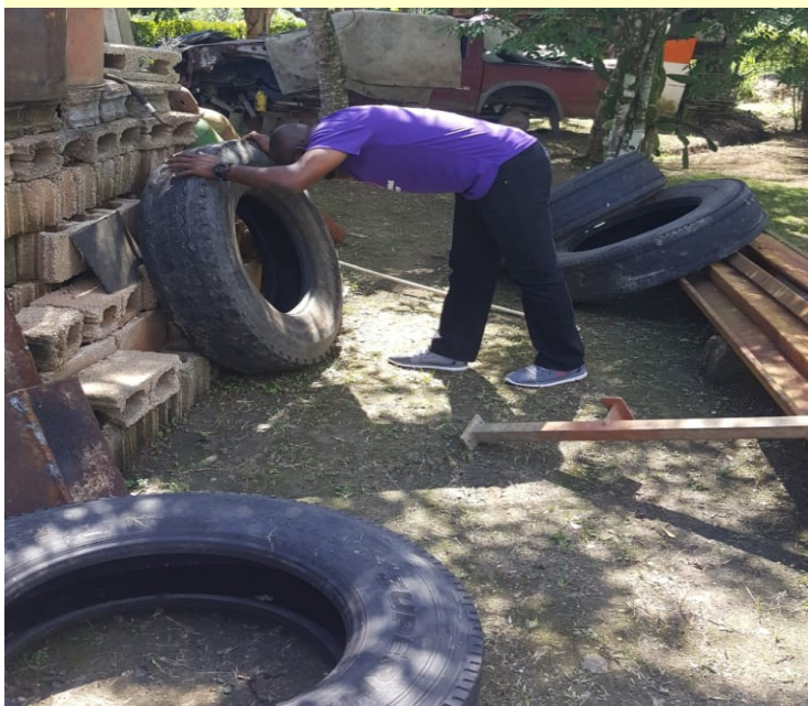
Clean-up activities in addition to mosquito search and destroy activities were done in Clarendon.