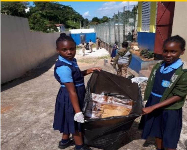
Students from the Christiana Leased Primary School in Manchester removing garbage from the school compound on Friday, January 24.