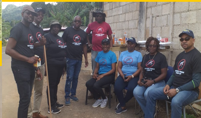
The team from the Manchester Health Services participated in clean-up activities in the community of Craighead.