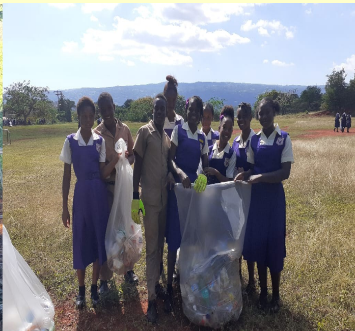
The Nain High School in St. Elizabeth was also a part of the clean-up activities.