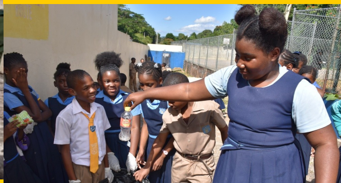
Students from the Villa Road Primary School in Manchester display proper disposal of garbage.