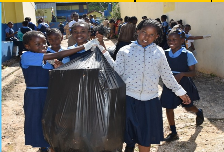
Students from the Villa Road Primary School in Manchester removing garbage from the school compound on Friday, January 24.

Over at Cross Keys High School, clean-up efforts on Friday included removal of plastic bottles and trash. Dean of Discipline, Samuel Smalling, told JIS News that the school's safety and security committee met and made a decision about all the areas on the compound that needed to be addressed. "We looked at drains, we looked at where old chairs and desks are stored and one of the major things were three pit toilets that need to be removed but that will be a long-term project," he said.