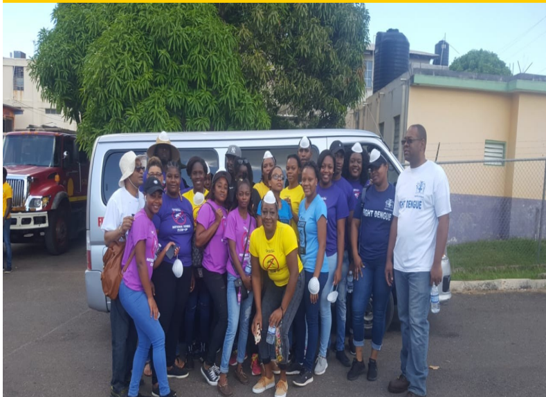
Staff members from the St. Elizabeth Health Services who participated in the clean-up activities.