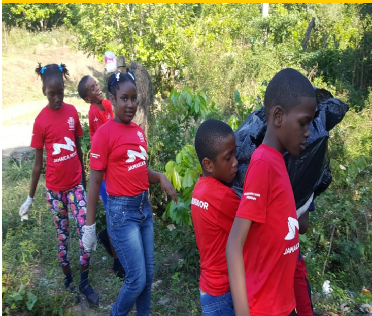
Ambassadors of the Jamaica Moves in Schools Club participate in the clean-up activities.