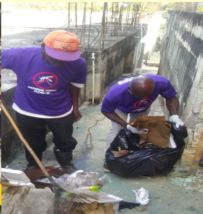
Clean-up activities being carried out by residents.