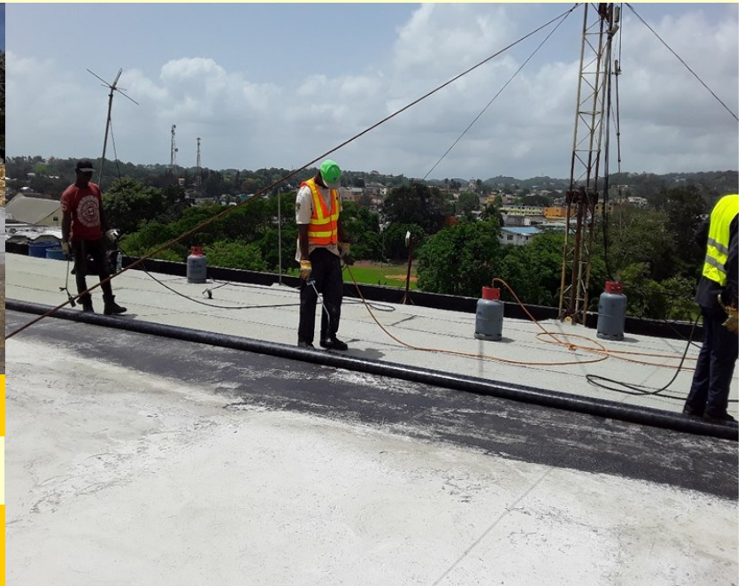
Installation of waterproofing membrane, including primer.