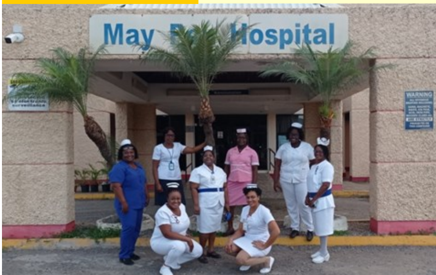
Some of the nurses at the May Pen Hospital.

The May Pen Hospital Nursing Department Services are piloted through its Mission and Vision Statements which state: Vision Statement; 'We envision the department as a trendsetter in nursing practice and research in Jamaica, having the most satisfied customers and motivated staff, enjoying an optimal state of health and well-being'. Mission Statement: 'The May Pen Hospital Nursing Department is to provide quality, evidenced-based nursing care to improve and maintain the health status of the people of Clarendon and its environs; delivered by competent, dedicated and caring staff in a peaceful and safe environment.'