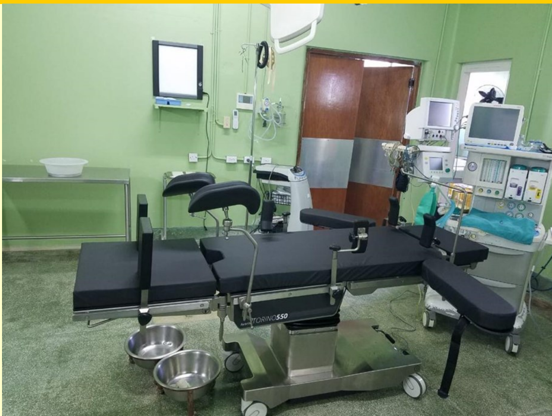
The new operating theatre bed.

"We believe that one of the key building blocks to a country's foundation is providing access to and developing the infrastructure of its healthcare system. It is with this in mind that we sprung into action upon hearing that there was a need for an operating theatre bed at the Percy Junor Hospital. This acquisition allows the surgeons to continue the important work they provide to the communities. Our valued donors of the RDMF are delighted to be a part of this venture" Mr. Dixon shared.