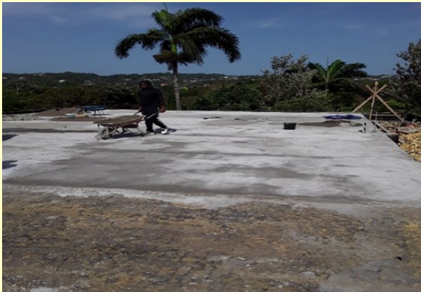
The casting of screed.

He thanked the NHF for its continued support to advancing public healthcare.