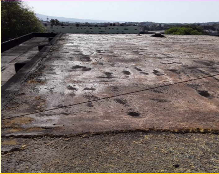
Photograph showing removal of existing waterproofing membrane/medium on the Regional Office roof.

The Southern Regional Health Authority's (SRHA) Regional Office located in Manchester benefitted from roof repair works valued at J $4.9 million.