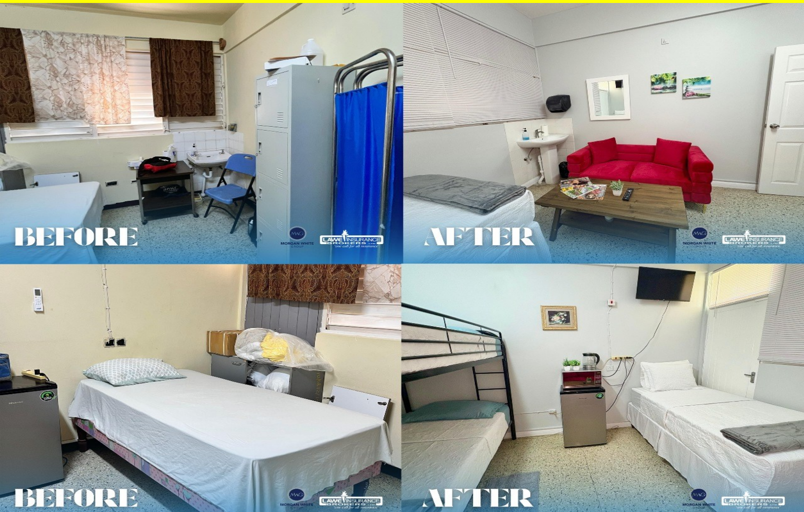
Before and after pictures of the refurbished lounges.