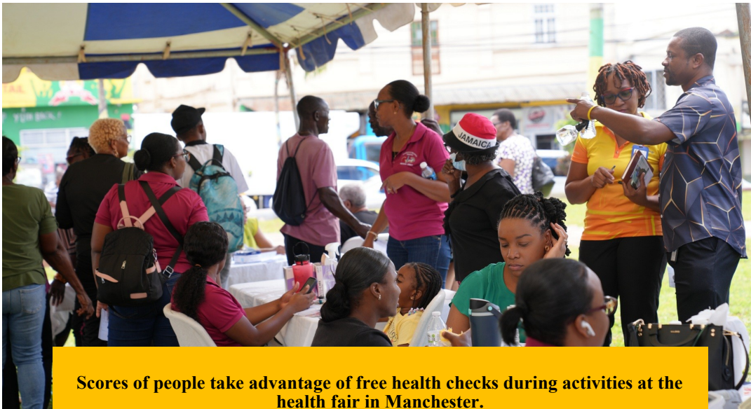
Scores of people take advantage of free health checks during activities at the health fair in Manchester.

Scores of people turned out for free kidney screening tests at a health fair hosted by the Mandeville Regional Hospital (MRH) Renal Department, as part of activities marking World Kidney Week. The event, held on Wednesday March 11, 2026, offered a range of services including blood pressure and blood sugar checks, urine testing, eye examinations and HIV testing.